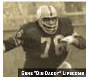
GENE "BIG DADDY" LIPSCOMB